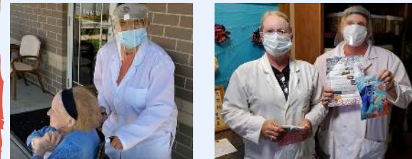
Celebrating our wonderful Nurses, CNAs, and Universal Workers during CNA Appreciation Week!