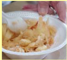
MAKING SOME TASTY APPLE PIE APPLES