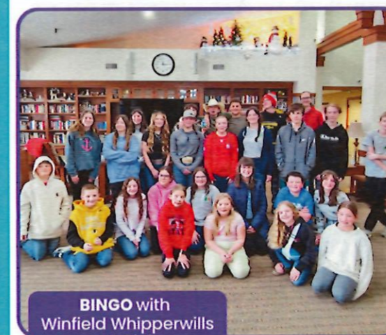
BINGO with Winfield Whipperwills 4H Club